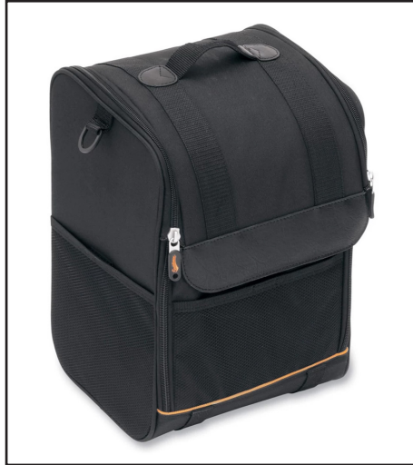
SSR1200 Dimensions: 15" H x 10" W x 8" D Measures 1,200 cubic inches