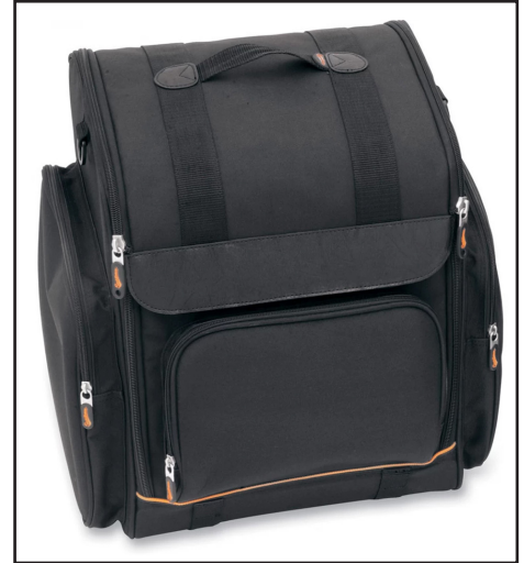
SSR1900 Dimensions: 17" H x 16" W x 11.5" D Measures 1,900 cubic inches